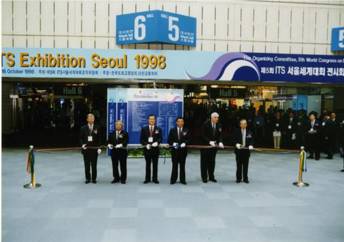
Exhibition VIP Tape cutting ceremony