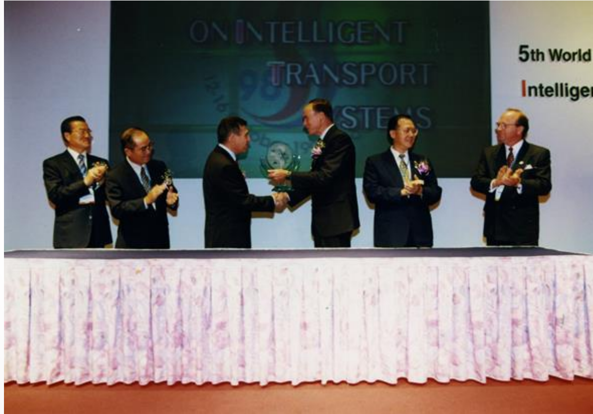
• Closing Ceremony •