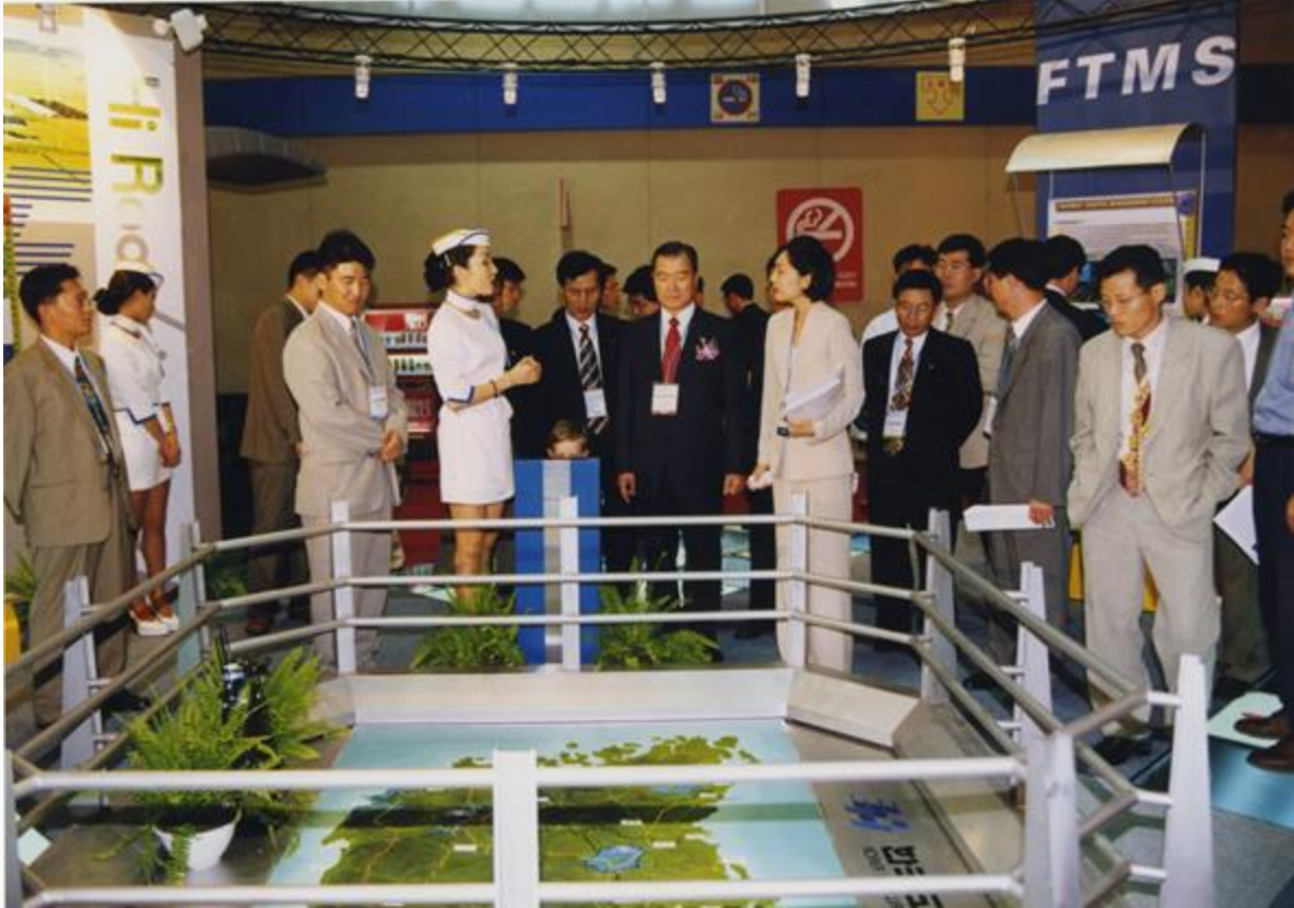
VIP Exhibition Tour