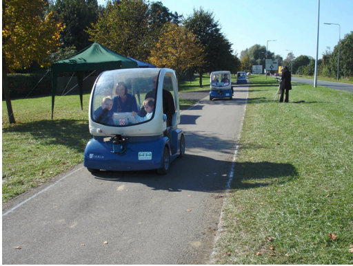
Figure 3. Cycabs during Daventry showcase

The users’ impressions were collected by following an acceptance questionnaire that is similar to that used for the ex-ante survey of the Rome site. Only seven indicators were considered compared to the other surveys, where more have been measured; however, differently from the other sites, all these indicators were surveyed in terms of both weight and performance rating. Therefore, in spite of the small number of indicators and the relatively small sample, the survey is of high value and allowed a more complete analysis of the system User Acceptance.