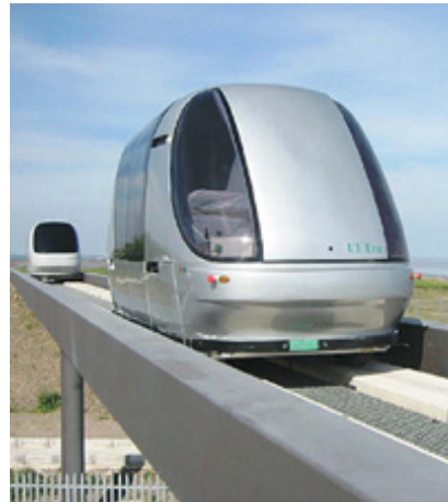
Figure 2. ULTra PRT vehicles for Heathrow

It is important to note that the Heathrow system will be the first large scale PRT to be deployed in a real application anywhere in the world. This is a significant breakthrough in the advancement of ITS. Therefore, although the evaluation of the systems is only at initial stages, it is worthwhile to mention it here.