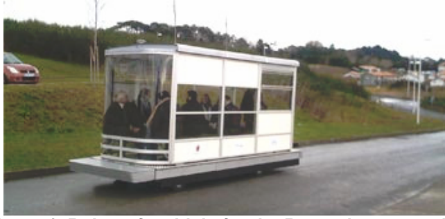
Figure 1. Robosoft vehicle for the Rome demonstration